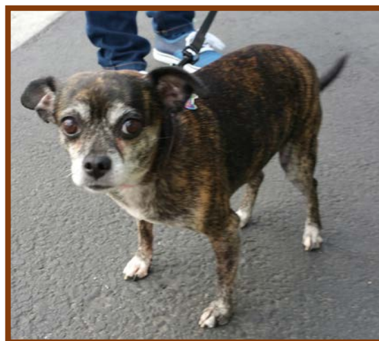
Roxy gives a big thank you!